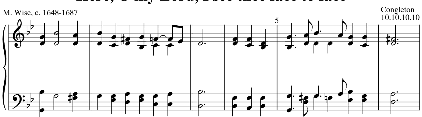
Here, O my Lord, I see thee face to face