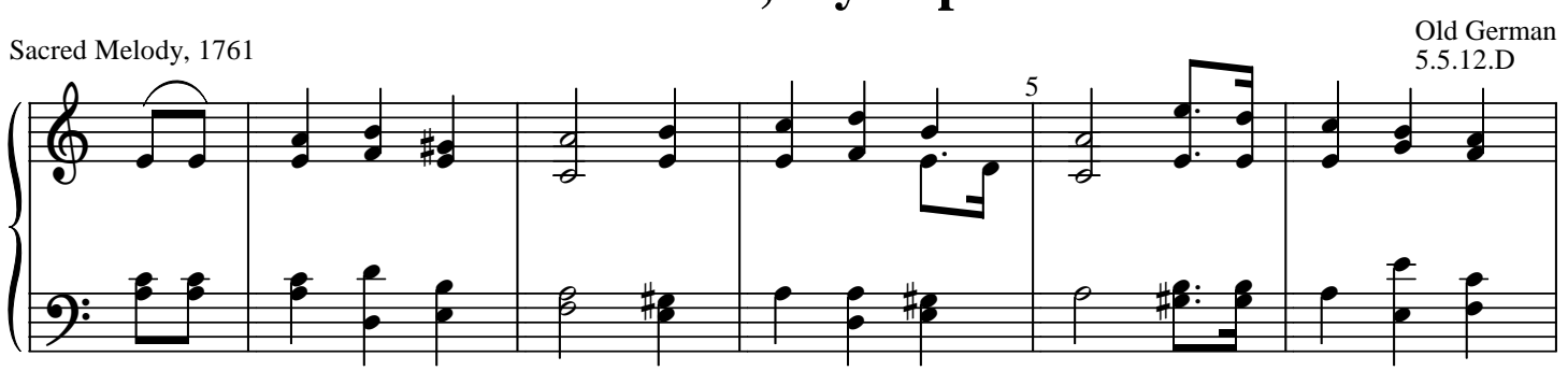
O Jesus, my hope