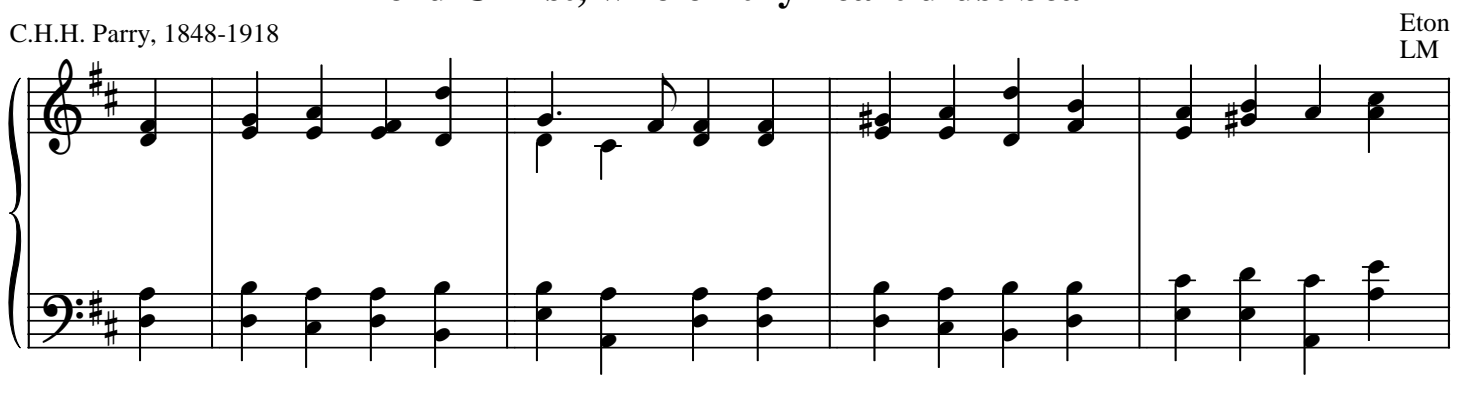
Lord Christ, who on thy heart didst bear