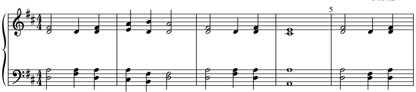
Bread of Life 64.64.D